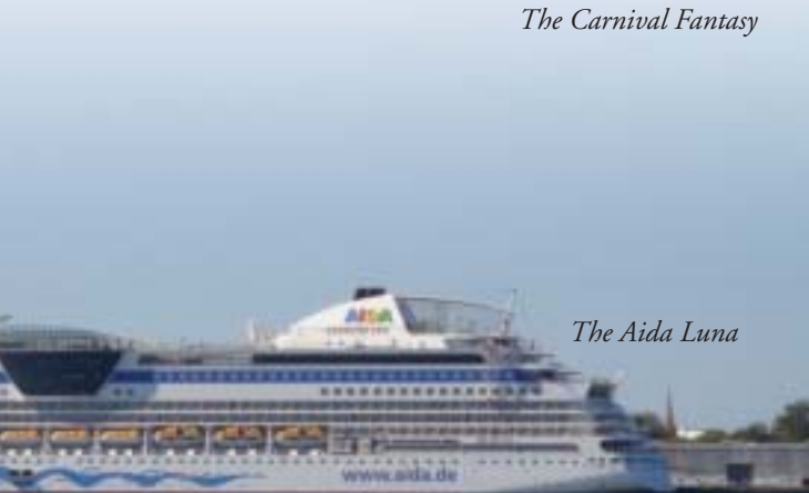
The Aida Luna