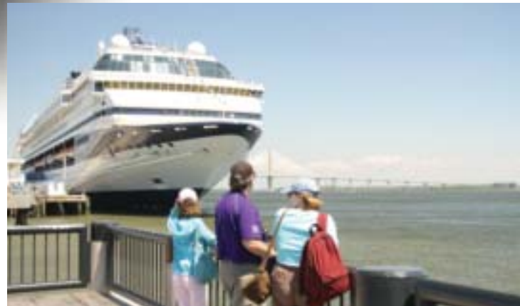
The Celebrity Mercury