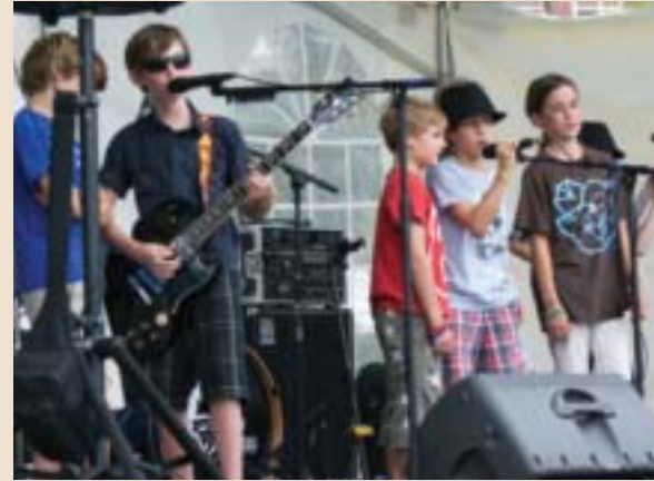
The 3 Dudes, youngest rock band on the Charleston music scene, wows the crowd.