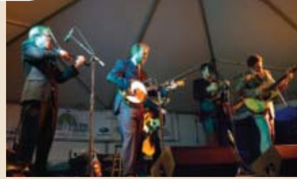
The Steep Canyon Rangers take center stage at downtown Charleston's Marion Square.