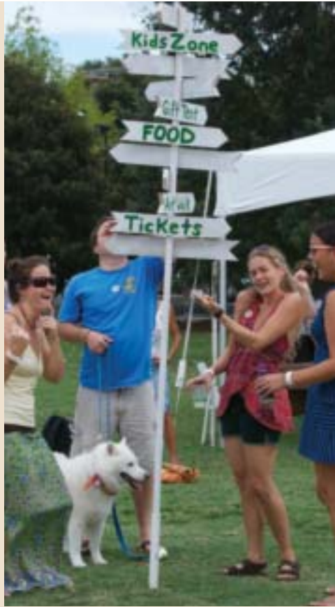
No matter where you're from or where you're going, the Green Fair is the place to be!