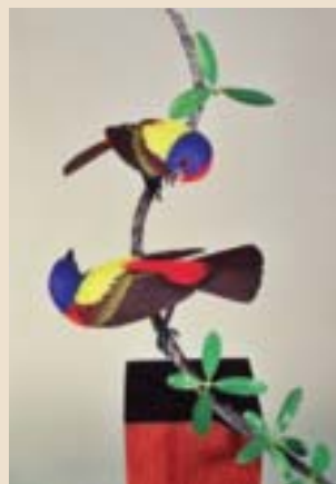
A pair of painted buntings.