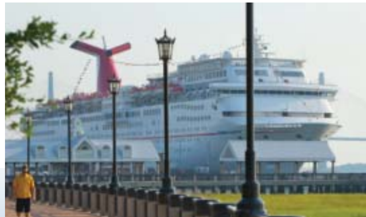
The Carnival Fantasy