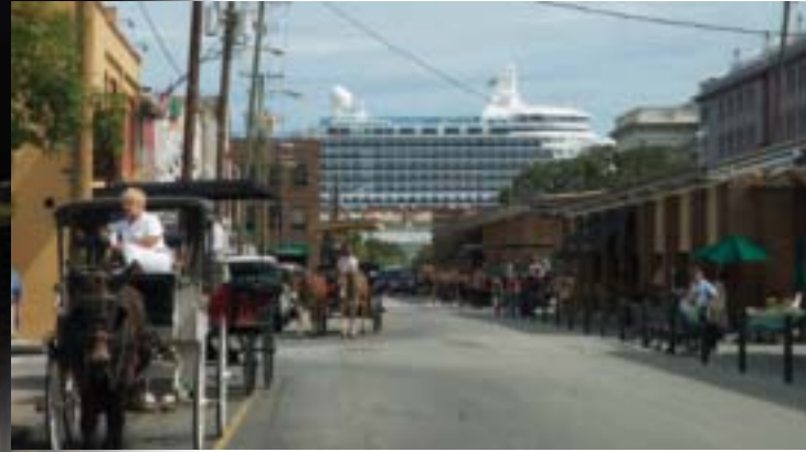
The Crown Princess