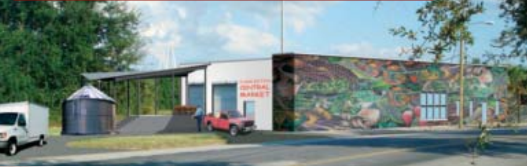
Gibson Guess Architects