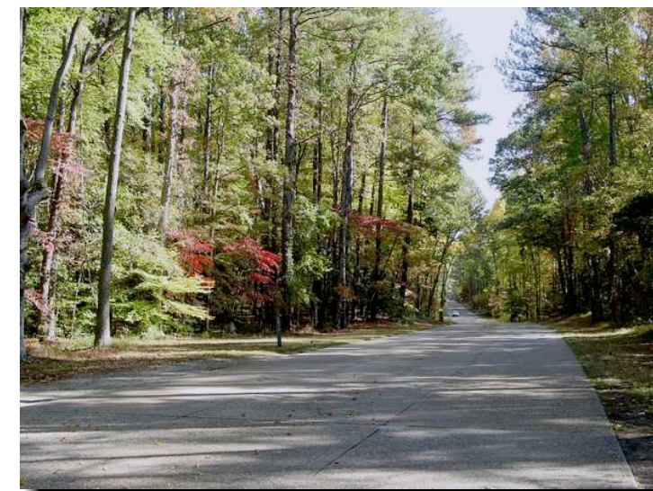
Colonial Parkway in Williamsburg, Virginia

Citizens interested in learning about the project have the opportunity to discuss their questions and comments directly with members of the project study team. Maps showing various environmental resources and preliminary alternative alignments are available for review. The preliminary alternative alignments for the Greenway shown during the meeting will be studied, along with other alternatives that will be developed based on feedback from the public and organizations.