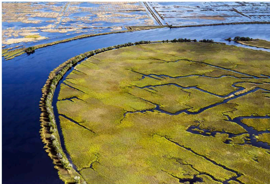
Combahee River wetlands, old rice fields

Nieuport Plantation, Yemassee, SC Cedars and pines line the river in the ACE Basin