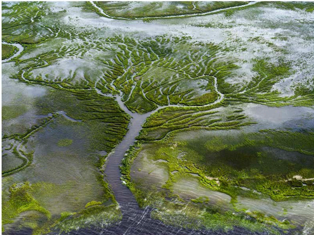
St Helena Sound wetlands