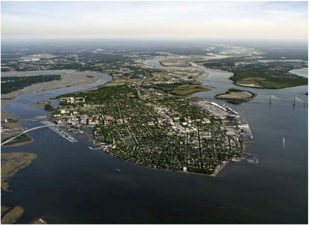
Charleston peninsula showing confluence of three rivers: Ashley, Cooper, and Wando